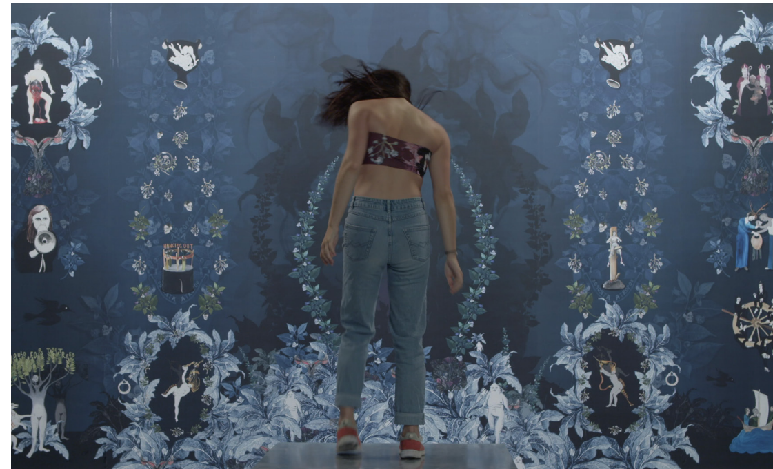
Left: Zanny Begg, The City of Ladies (still) 2017. Co-directed with Elise McLeod.

4. Thinking about these similarities and differences, why do you think Begg and McLeod have chosen to present their exploration of feminisms in this way (consider their artistic intention)?