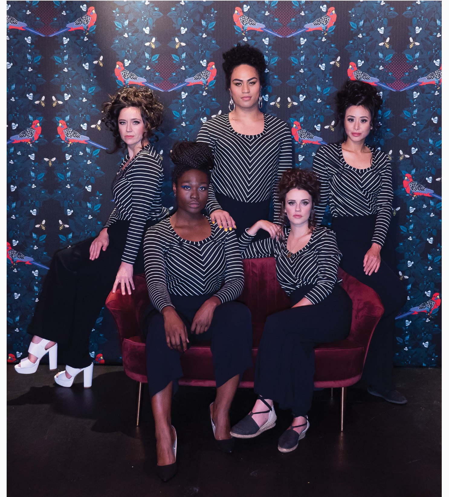
Above: Zanny Begg, The Beehive (production still) 2018.