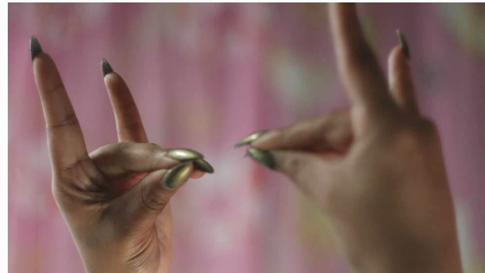
Left: Zanny Begg, Stories of Kannagi (still) 2019.

2. In groups, compare your list of themes and discuss the following questions: • How do these themes relate to Australia’s changing identity as a nation? • Why is it important to learn about perspectives of Australians from different backgrounds and experiences?