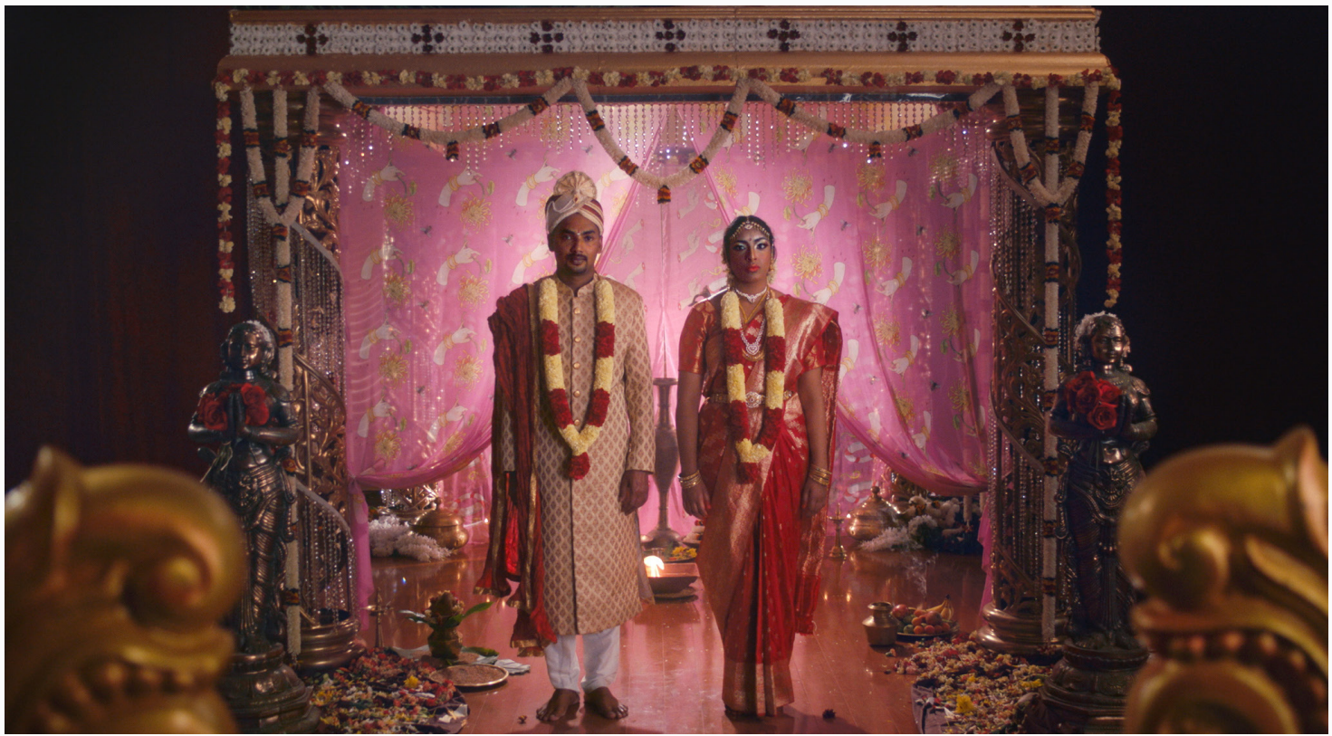
Above & below: Zanny Begg, Stories of Kannagi (still) 2019.