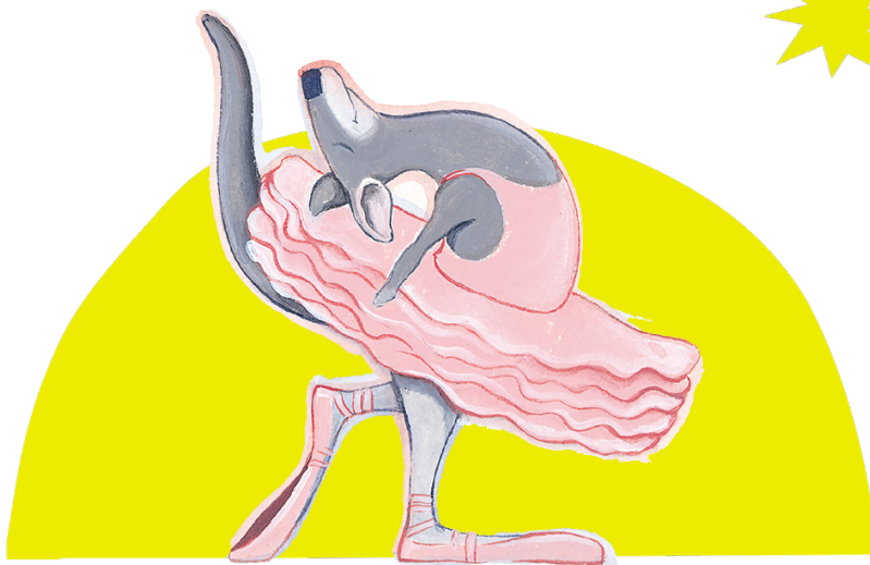
Illustration by Bruce Whatley

“Josephine Wants to Dance brings the story of a stage-struck macropod to life with enormous charm and sly wit.”