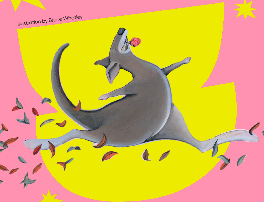
Illustration by Bruce Whatley