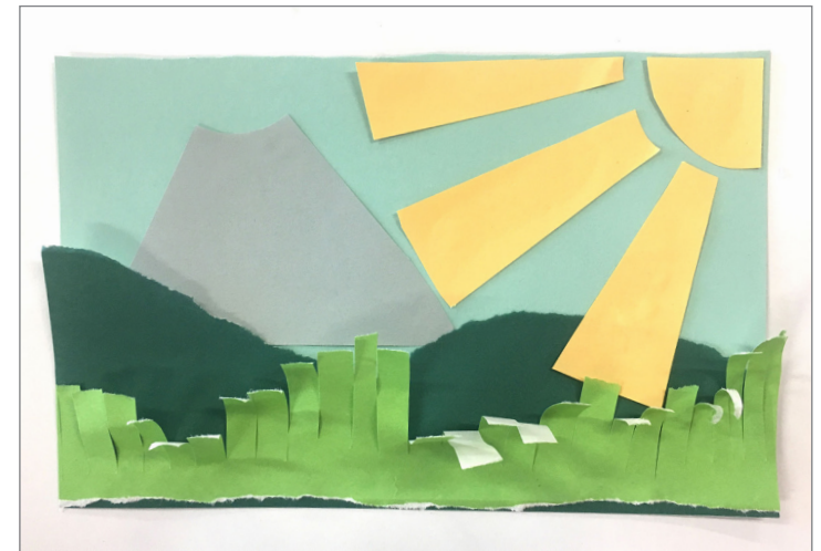
Step 4: Fold or curl edges of your finished landscape