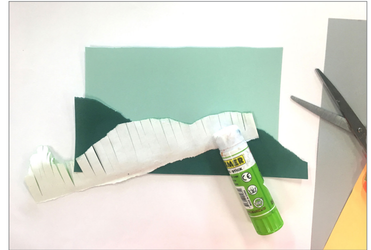
Step 2: Tear and cut shapes for your landscape