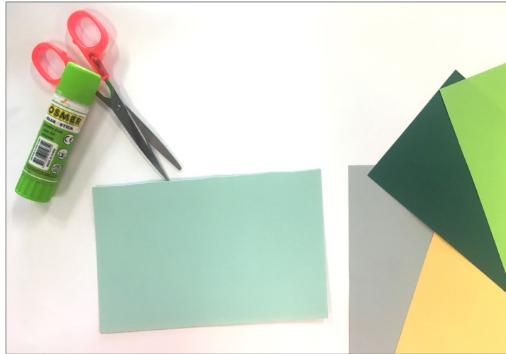
Step 1: Choose your colours

Materials: Coloured paper, scissors and glue